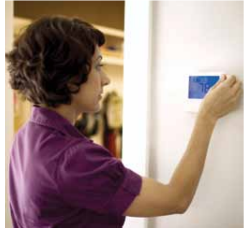
Programmable thermostats make it easy to save by offering pre-programmed settings to regulate a home's temperature throughout the year.

pliances like washing machines to ENERGY STAR-rated models can save up to $140 per year.