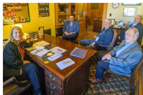
Senator Elaine Bowers (left)