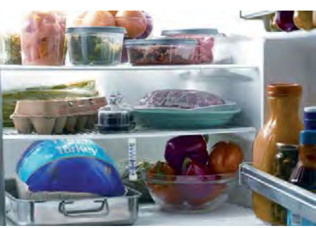
First and foremost, keep your refrigerator and freezer doors closed as much as possible to maintain the cold temperature.

chilly: find it by scanning for "ice" or "carbon dioxide" in the phone book. It will take 25 pounds or so to keep a full, 10-cubic foot freezer safe for three to four days. Fifty pounds of dry ice should hold an 18-cubic foot full freezer for two days. Wear heavy-duty gloves or use tongs when handling dry ice—the temperature of dry ice is -216 degrees Fahrenheit—and separate it from food with cardboard to prevent freezer burn.