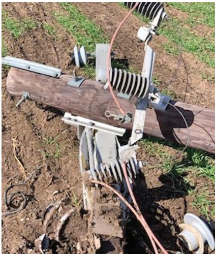
Damage from the ice storm in Oklahoma caused outages for thousands of members.

Freezing rain combined with high winds led to large power outages for parts of southwest Oklahoma on Oct. 27. Following the extensive damage to power lines and poles, Kansas electric cooperative line crews deployed to assist five Oklahoma cooperatives who requested mutual aid assistance. Organized by Kansas Electric Cooperatives,