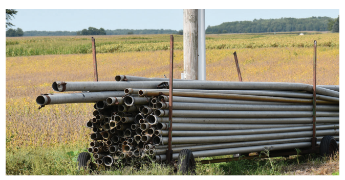
Irrigation pipes are often made of aluminum, a great conductor of electricity, so be extremely careful when assembling or working with irrigation systems and equipment.